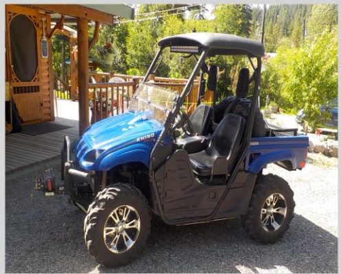
Hayes Creek's Side by side