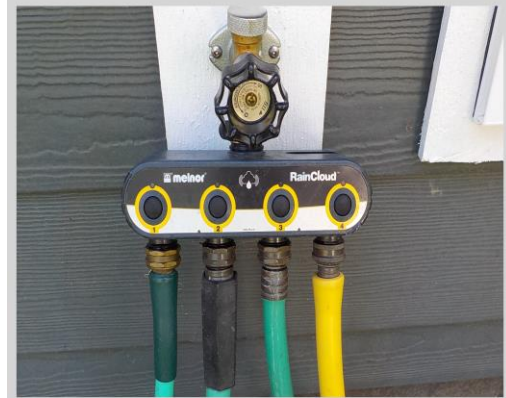
Wi-Fi auto sprinkler hydrant