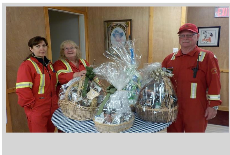
Four Beautiful Baskets by Barbara