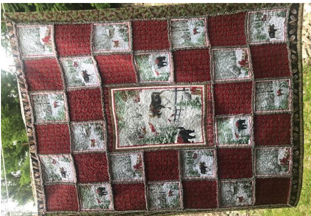
Handmade quilt made by the Crafty Ladies